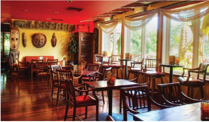
The exotic tiki décor at Trader Vic's.