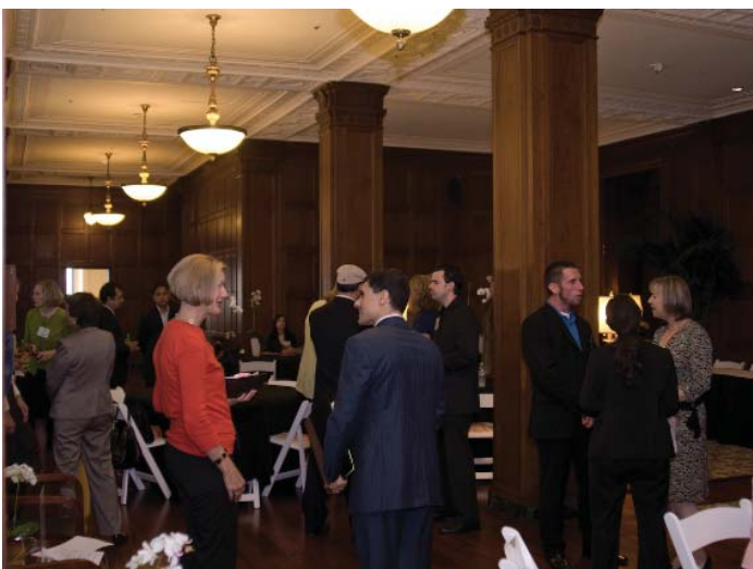
Attendees mingle at the Bently Reserve.